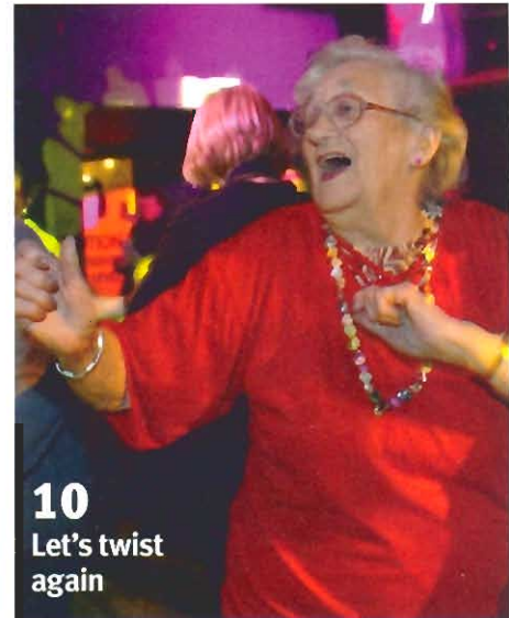
10 Let's twist again