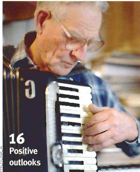
16 Positive outlooks